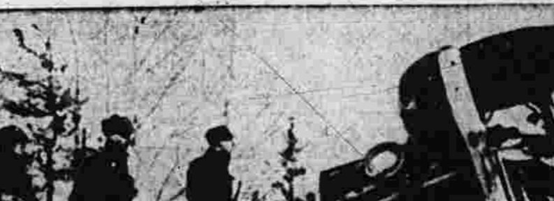
Representing the desperate and seemingly hopeless stand the small Norwegian forces are making against the German drive north from Oslo, these Norwegian soldiers stand guard over an ammunition dump...